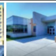
Thames Campus 1001 Grand Avenue West Chatham, ON N7M 5W4