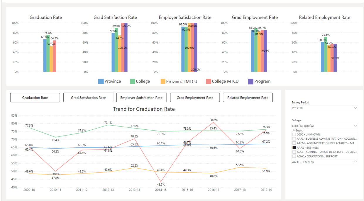
Key KPI Metrics For: COLLÈGE BORÉAL For Survey Period: 2017-18

This report can be used to evaluate the level of success of college graduates in the field, and therefore, give insight as to how well a college is meeting its objectives (e.g., high number of graduates, high graduate satisfaction, high number of graduates employed, high number of graduates employed in their field of study, etc.). It also reveals how well graduates of/from a specific program/college are doing in comparison to provincial and MTCU (provincial and college) standards.